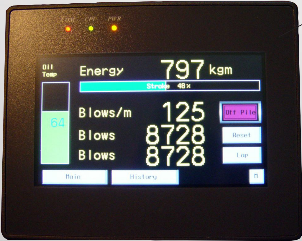
INTERFACE SCREEN MOUNTED ON POWER PACK

With constant drop weight position monitoring, the velocity of the drop weight is also known, therefore energy output can be accurately measured and is displayed to the operator on the powerpack interface screen. This information can be recorded direct to a laptop via a Dawson software interface, and can be saved in standard spreadsheet formats, giving a blow by blow account of every pile driven and a day to day productivity record.